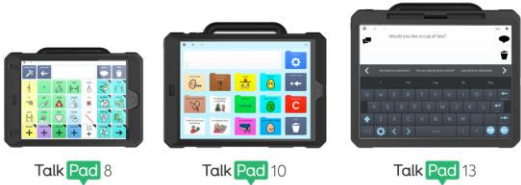
Talk Pad 8/10/13 - Talk Pad