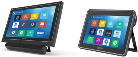
Grid Pad 10S, 12, 15 - Grid Pad