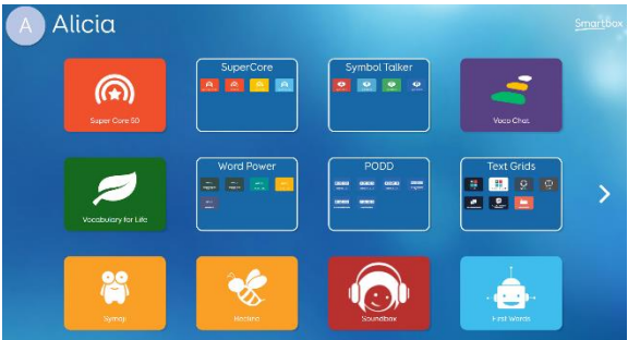
Grid 3 (Windows) - Grid 3