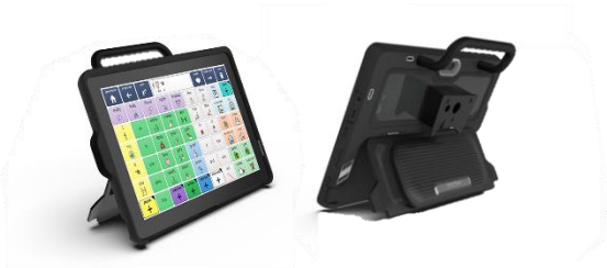
Touch Pad - Touch Pad